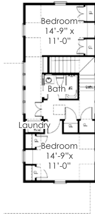
Second Floor Plan 567 square feet